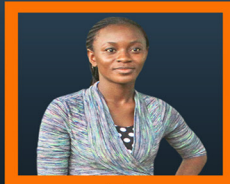
NAKKAZI CATE DIR FINANCE